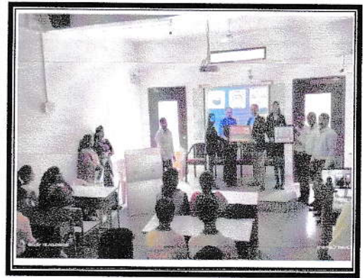
Photo graph: Seminar on Credit based certification and Personality development programme

Principal Institute Of Pharmaceutical Edu Boradi-425428