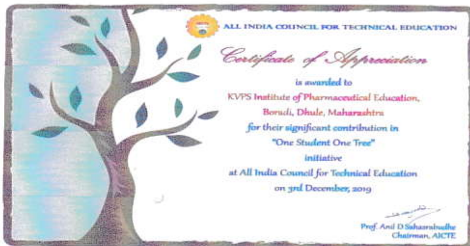
Certificate of Appreciation by AICTE