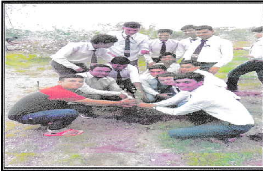
Tree Plantation near Boradi Village

Name of collaborating agency: Gram panchayat Boradi